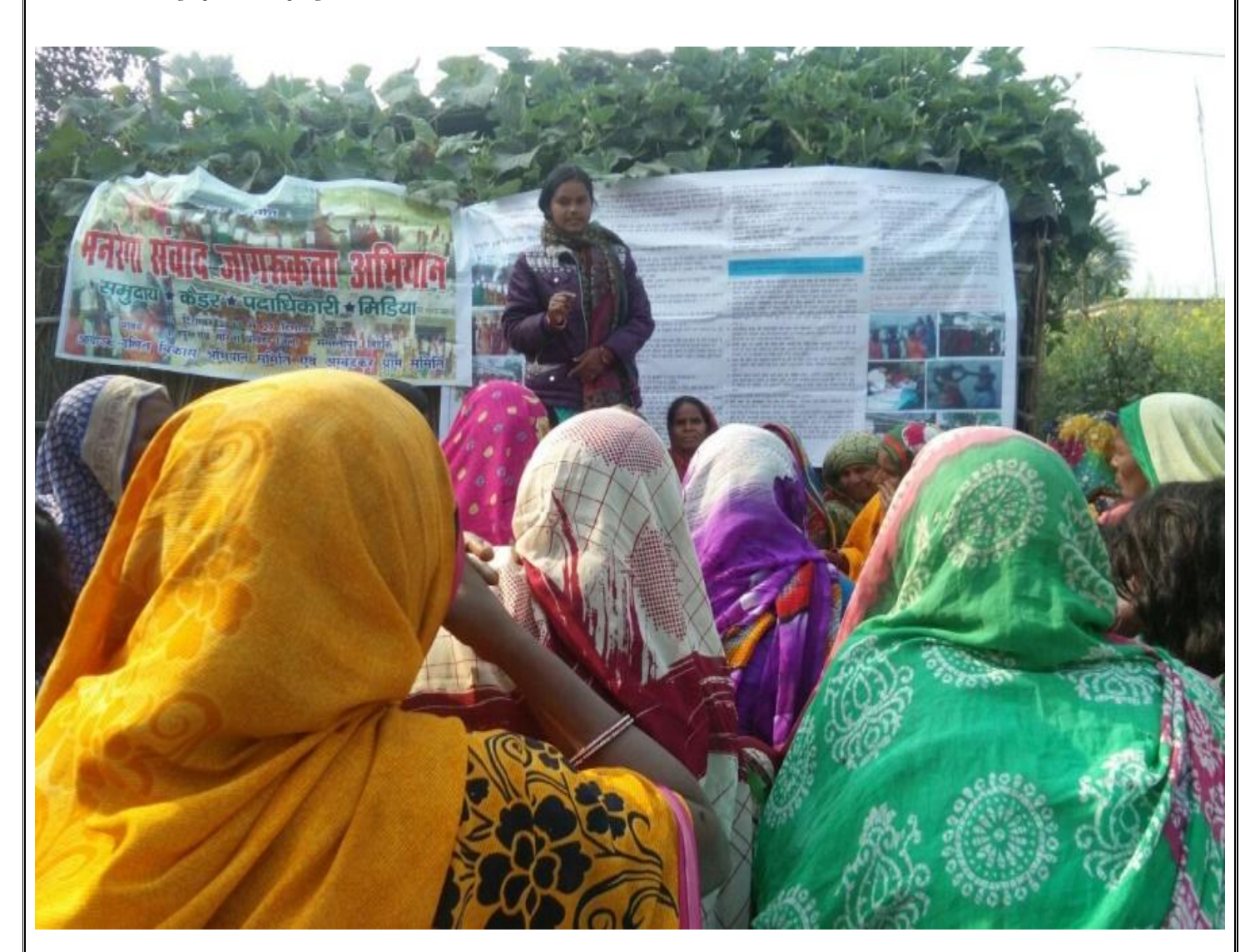
Photograph 4: Campaign on MGNREGA

issue of school was raked up. With the support from local level representatives of RTE forum People were gathered and they submitted an application to education officer of Bodhgaya marking a copy to District Magistrate to organise a school in the vicinity. They got an assurance from the officers and it is believed that the children from this slum will get an opportunity to study in education mainstream system.