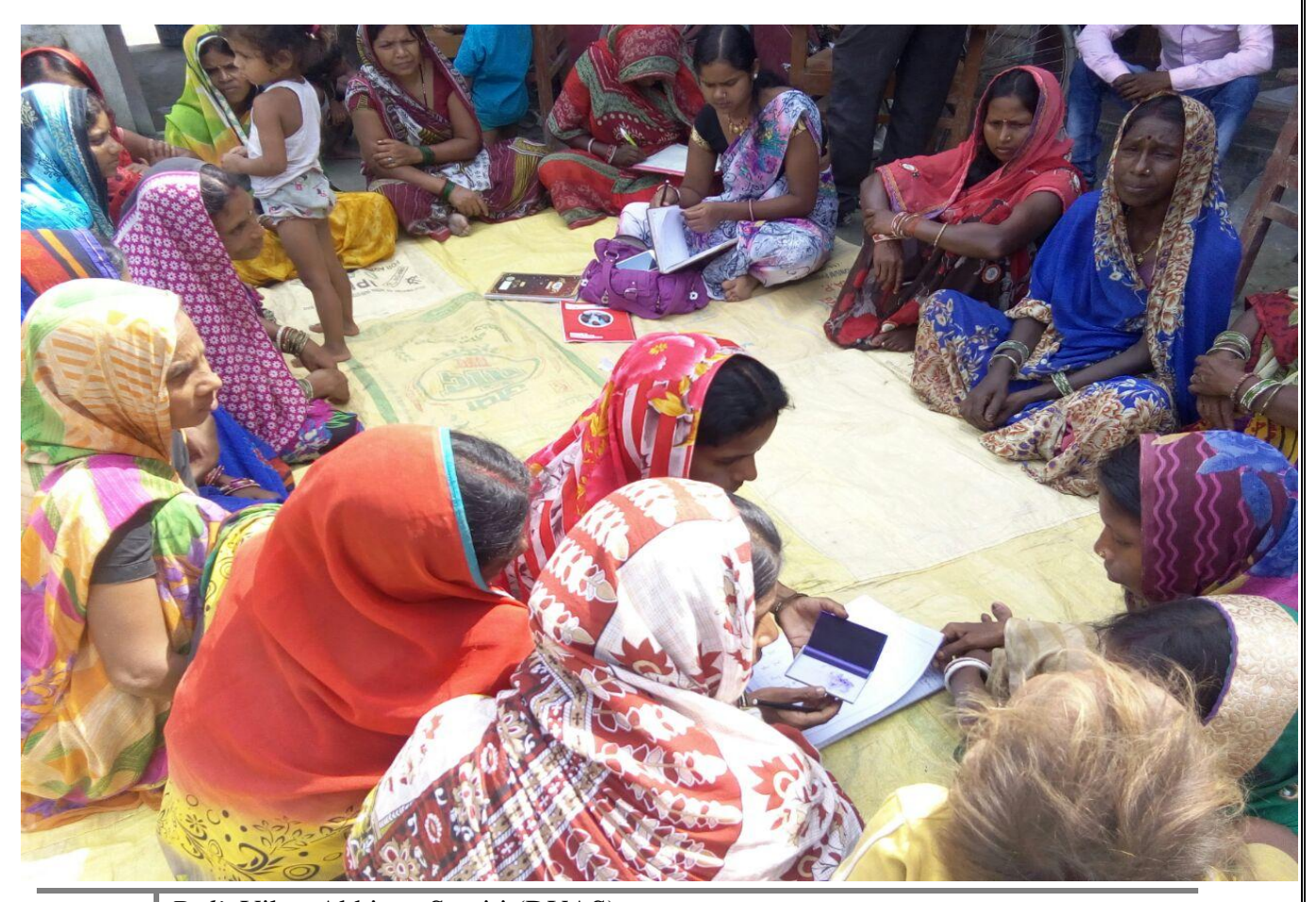
Dalit Vikas Abhiyan Samiti (DVAS)

development of the marginalized societies and instrumental in creating awareness around issues related to rights and entitlements. The organization has been involved in periodic study of educational process of the marginalized as Scheduled Caste children to understand the factors and causes responsible for exclusion of children for the educational process. The organization has been advocating for implementation of Right Education 2010 norms at the educational institution with the government. It has also drawn a campaign to sensitize the parents with community involvement for active participation and management of the centres. The organization is running JAGJAGI centres at Patna and Bodhgaya to motivate children to join the mainstream education system