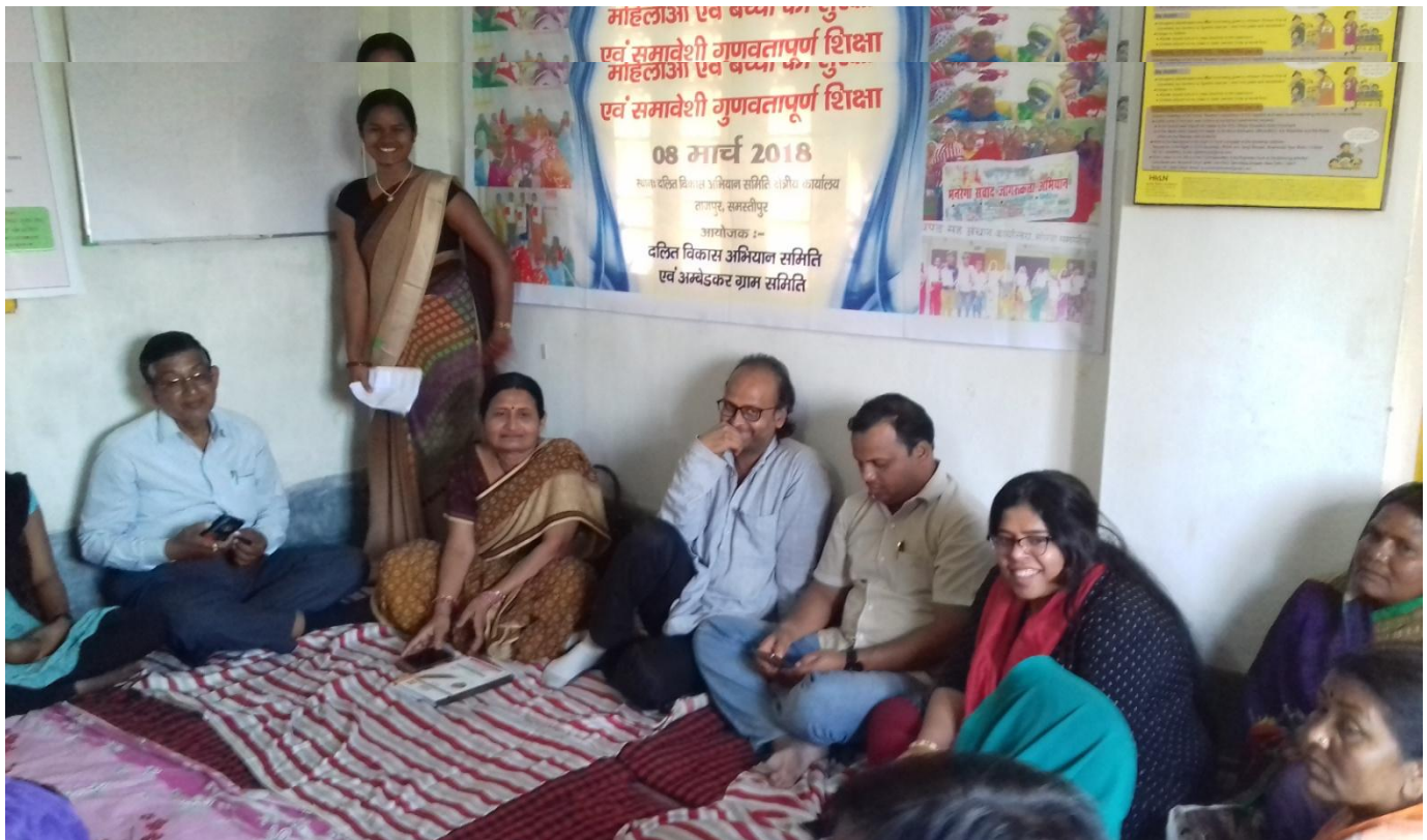
Photograph 6': Gender Campaigns Voices

director of Women's Helpline, appreciated the initiative.