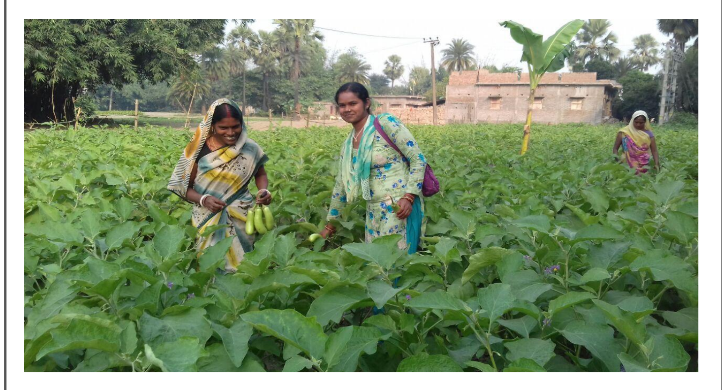
Photographs:7 Community livelihood